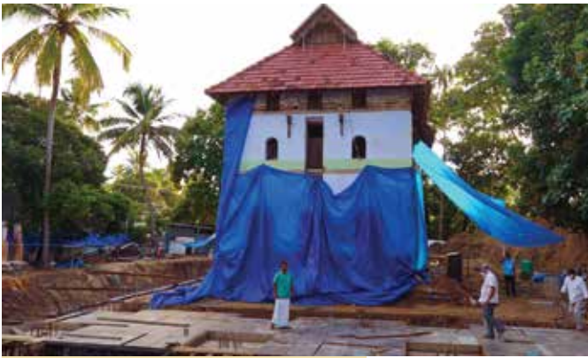
Kodungallur Cheraman Juma Masjid