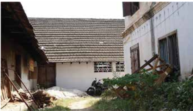
Kodungallur Temple Museum