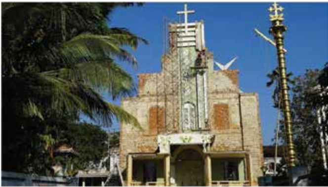
Kottayil Kovilakam Holy Cross Church