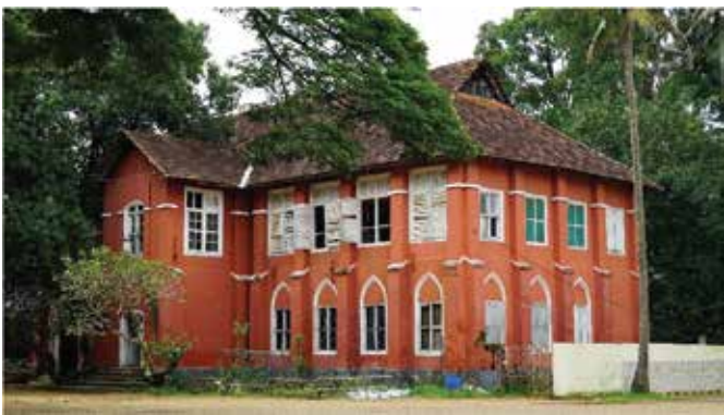
Gothuruth Chavittunatakam Museum