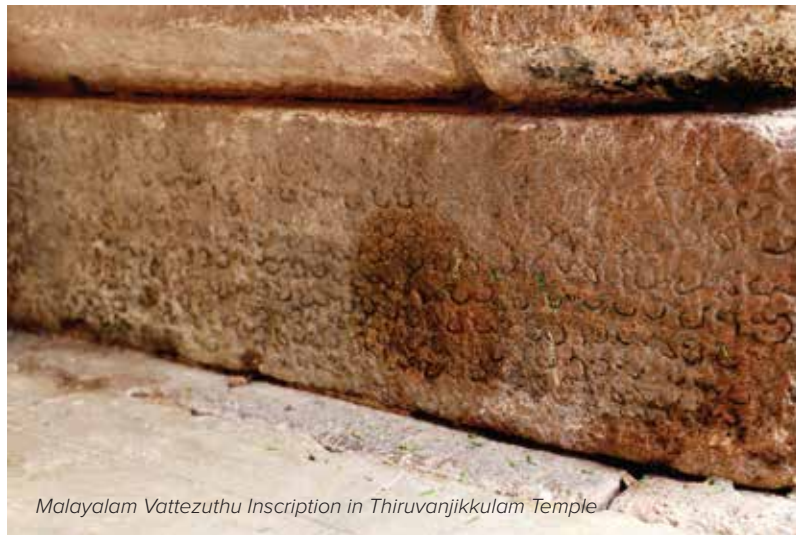
Malayalam Vattezuthu Inscription in Thiruvanchikkulam Temple

This temple is two kilometres to the south of Kodungallur temple. It is situated to the north of “Cheraman Parampu” (Cheraman’s Compound) where the royal palace of Cheraman Perumal is believed to have existed. The temple is rich in bas-reliefs,